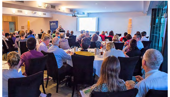
Almost 80 GPs attend the PHN's National Disability Insurance Scheme GP Readiness event in February 2018

Login username: Brisbane Password: North