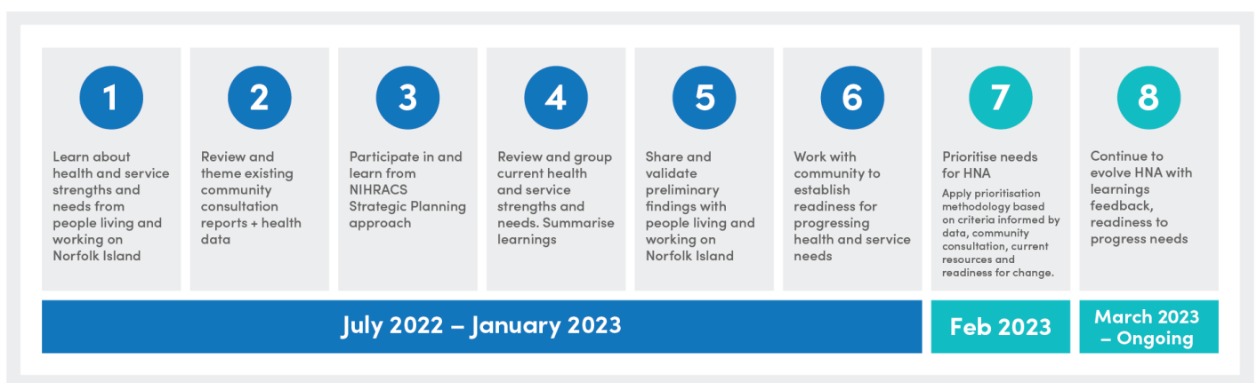
Figure 1: Norfolk Island Health Need Assessment development process

The Health Needs Assessment (HNA) was jointly undertaken in partnership with Norfolk Island Health and Residential Aged Care Services (NIHRACS), Norfolk Island community, Queensland Department of Education and Metro North Health (MNH). In the context of limited quantitative data, the focus of this HNA was building strong community relationships and undertaking effective consultation that built on previous processes. This was to be balanced with previous consultation with Norfolk Islanders by mainland service and consultants, and a desire to form constructive working relationships. An eight-step process (Figure 1) was developed to guide the process. It is followed by a detailed description of the activities and outcomes of each step.