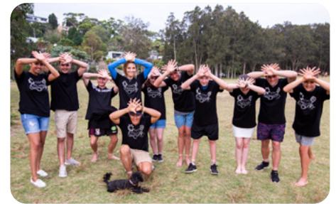
Aboriginal-On Track' workshop in progress