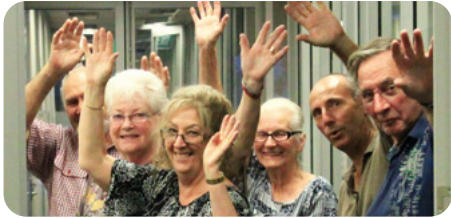
'You're Not Alone' Substance Abuse Support Group