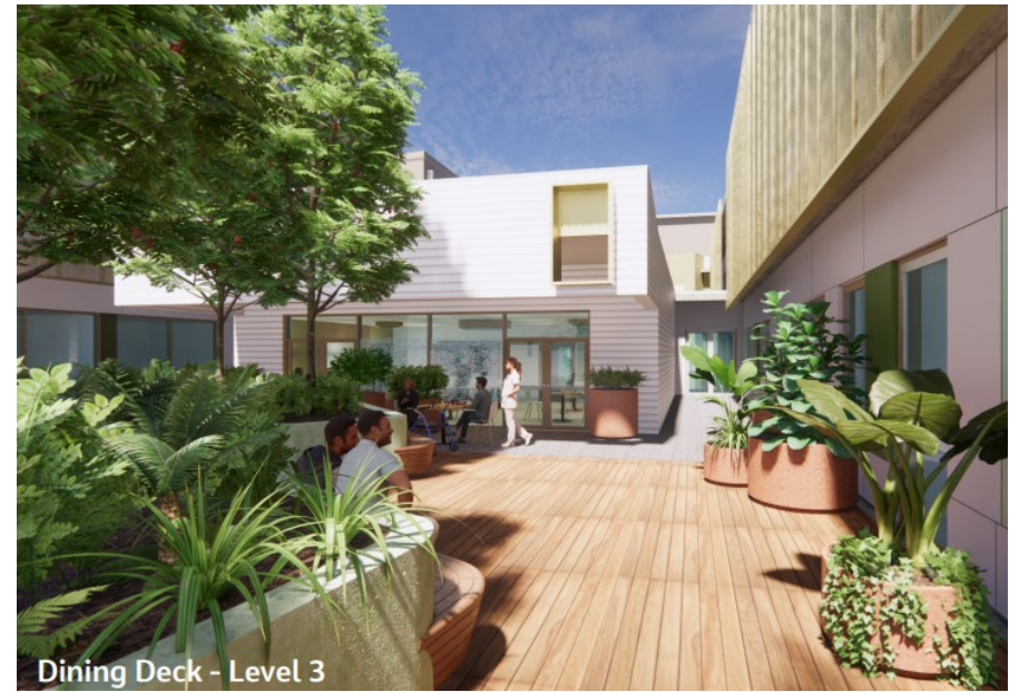
Dining Deck - Level 3