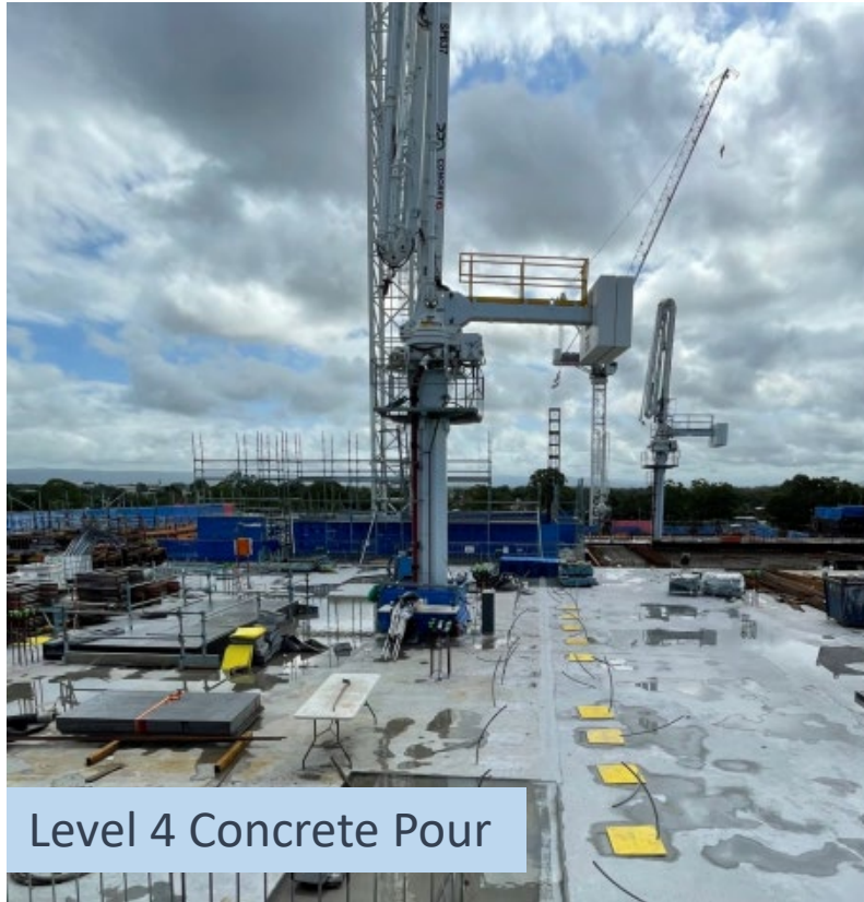
Level 4 Concrete Pour